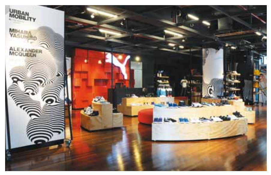
The PUMA LAB