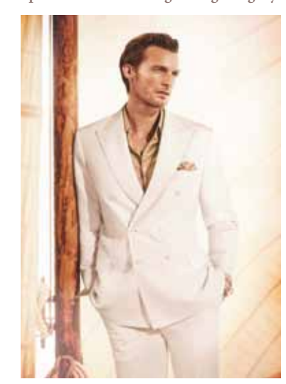
2012 Spring Summer collection

PPR has great ambitions for Brioni, and Brioni has great ambitions for men's fashion – a made-to-measure combination.