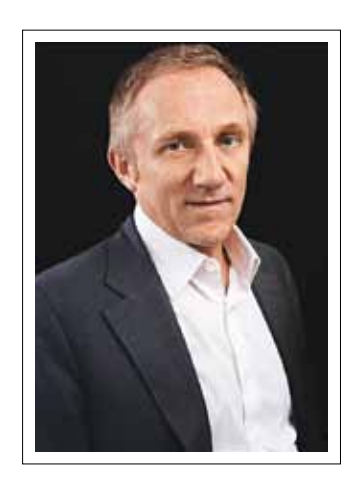
Our operating and financial performance in 2011 was excellent."